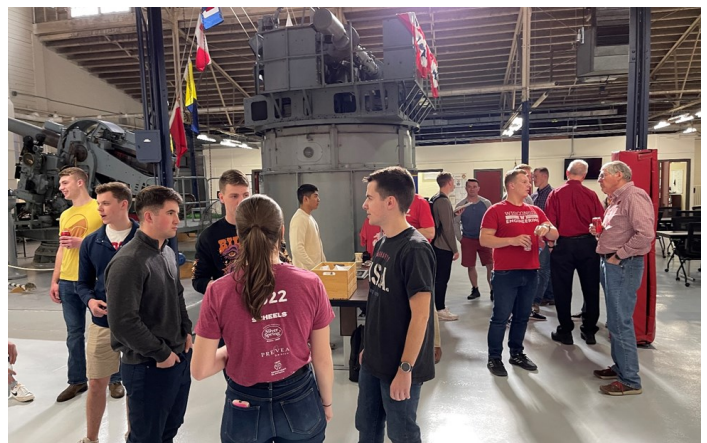
Alumni and Midshipmen at the Summer Sendoff Mixer, May 2022

Our capstone event, the Annual Reunion Weekend , will be held on Friday, 30 September, and Saturday, 1 October as the Badgers take on the Fighting Illini. Tickets are available now for $73 each seat and sales will secure after 31 August. Details on the social events are outlined in a 1 July NROTC Alumni Association email.